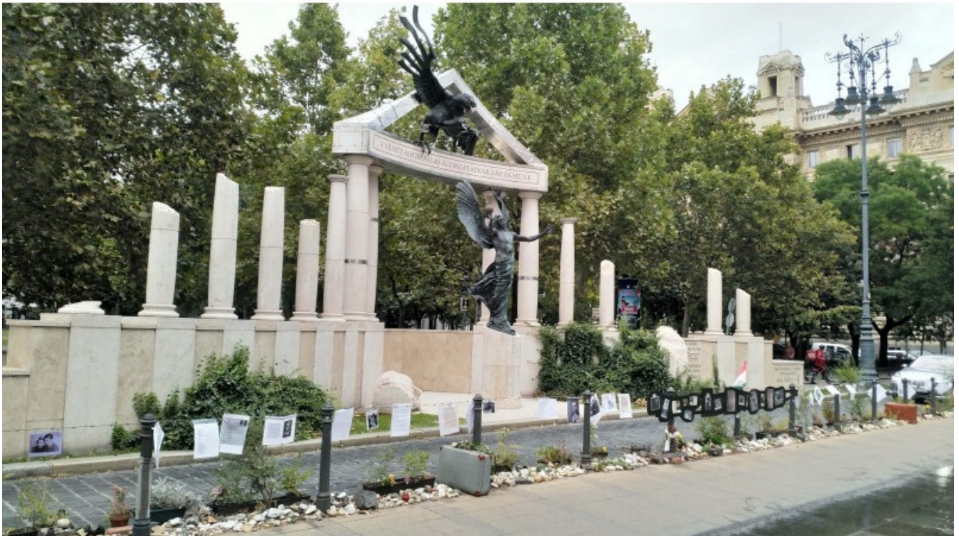
3 / 3 Memorial for the Victims of German Occupation in Budapest

* This project has received funding from the European Research Council (ERC) under the European Union's Horizon 2020 research and innovation programme (GMM - grant agreement No 816784).