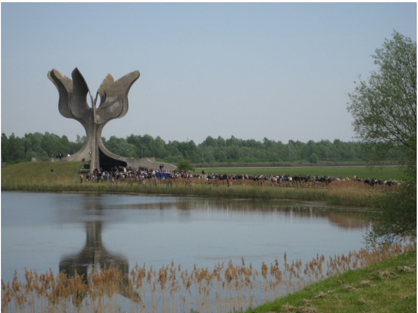
1 / 3 Commemoration at the Jasenovac Memorial in Croatia

Several of the trends described here are typical not only in Poland and Hungary, but these two countries have taken them farther by limiting freedom of speech and attempting to monopolize the media. Again, a broad spectrum exists between shouting out your understanding of the past in the main square and being arrested for it. In the process of the integration of post-communist countries into the EU, the memory of traumatic pasts has been canonized and transformed in a way that contributes to the – always political, disputed, and hierarchical – formation of a European space of communication and memorial landscape. In recent years, an anti-European and undemocratic spirit has been gaining ground – and the mnemonic warriors are the ones who have spearheaded this spirit.