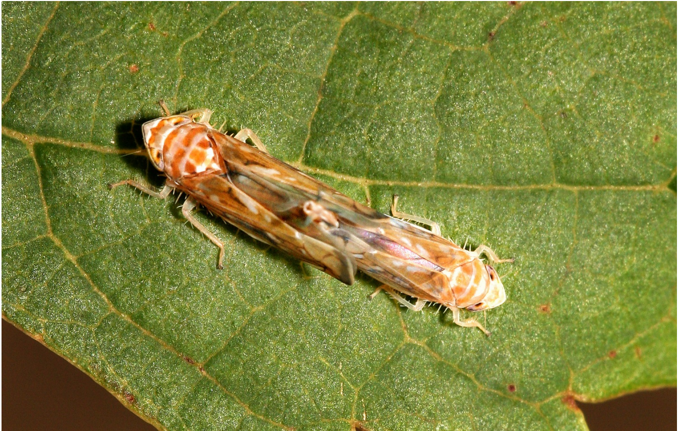
American grapevine leafhopper, mating