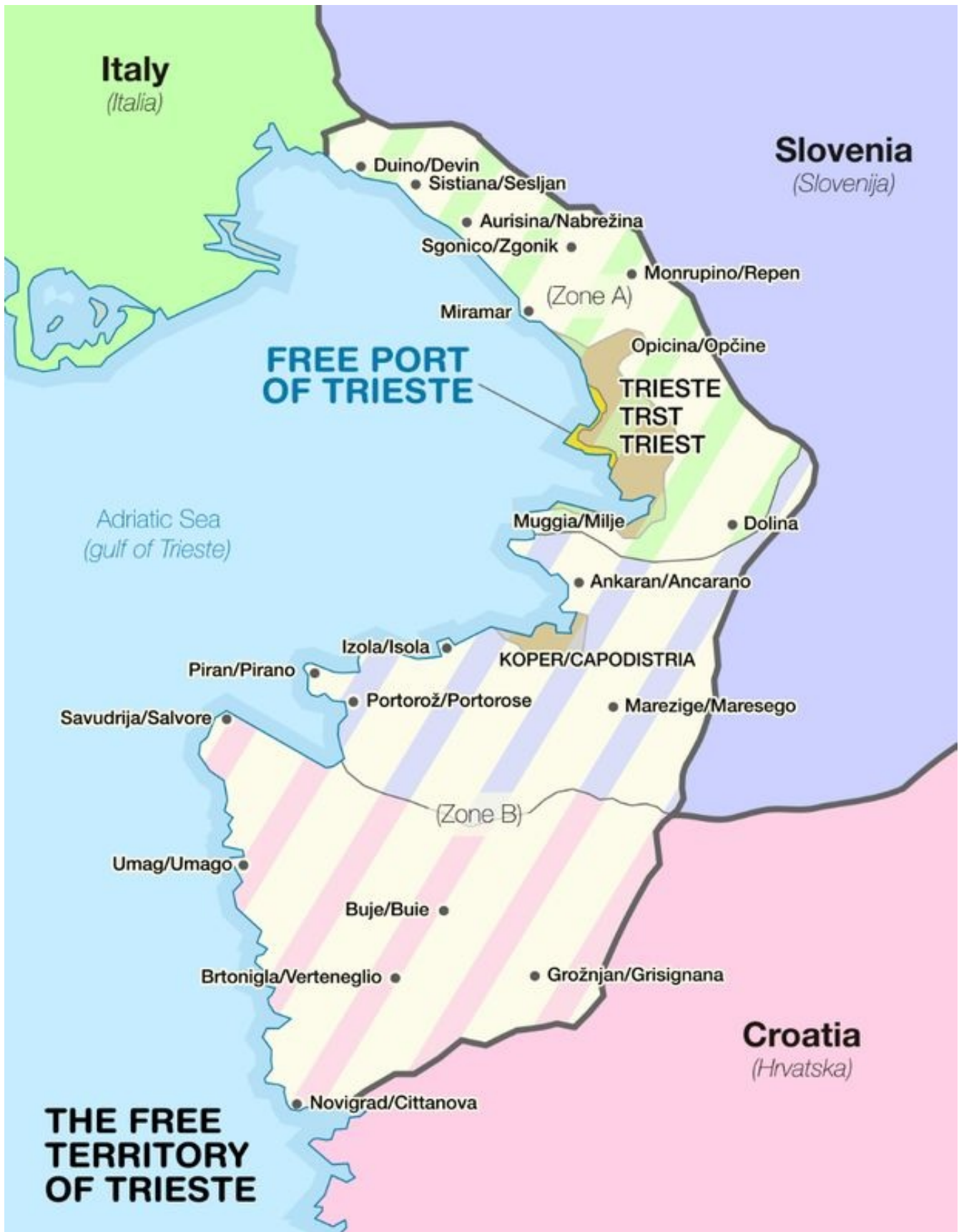
Map of the Free Territory of Trieste 1947-1954.