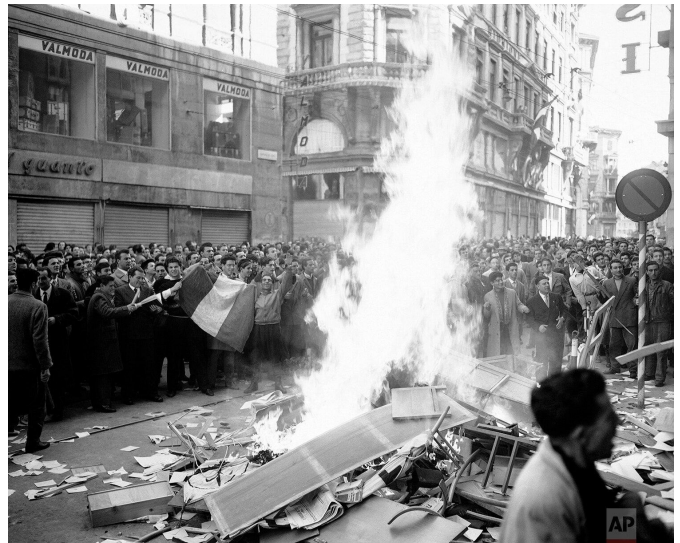
Trieste riots (November 1953).

On August 11, 1948, the Chief of the General Staff of the Yugoslav army, General Arso (Arsenije) Jovanović ( https://pressto.amu.edu.pl/index.php/bp/article/view/12698 ), left his home in Belgrade with the official intention of going hunting. In reality, he had reunited with other high-ranking officers loyal to Stalin, and, when he wandered into the woods on the border of Romania, he was killed by Yugoslav border guards. In all likelihood, his goal had been to reach Bucharest where, with the support of the Soviets and local authorities, he was expected to establish in exile a Yugoslav communist party loyal to Moscow. The personal story of Jovanović, a leading figure of the regime, tells us of the dilemmas experienced by the Yugoslav population following the Cominform Resolution of June 28, 1948. Moreover, he is a reminder of the other important international political issue with which Belgrade grappled during the post-war period: the Trieste crisis. In fact, Jovanović participated in meetings with Western diplomats regarding the crisis held in Belgrade in May 1945 as well as in negotiations organised in Duino the following month.